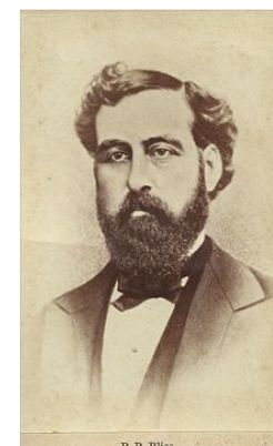
Philip Paul Bliss