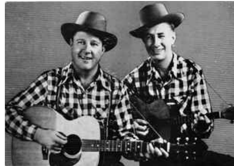
Alton and Rabon Delmore

Fiddlin' Arthur Smith (April 10, 1898 - February 28, 1971) was born and raised on a farm near Bold Springs, Tennessee. He learned to play the fiddle at an early age, his first influence