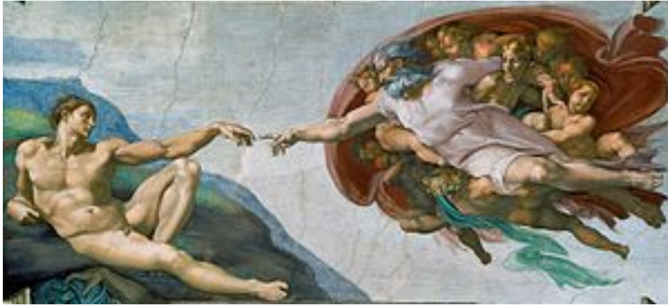
The Creation of Man, Michelangelo painting on the Sistine Chapel ceiling, circa 1511 - 1512,