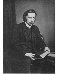
John Mason Neale

A literal translation demonstrates how faithful Neale—the prince of 19th-century translators—was to the original text: “Glory and honor and laud be to thee, Christ, King and Redeemer, Children before whose steps raised their Hosannas of praise. . . .”