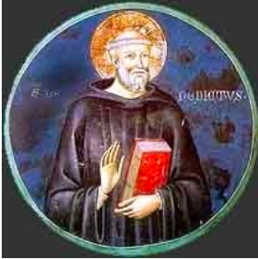
Theodulph of Orleans

“ All Glory, Laud, and Honor ” is perhaps the quintessential Palm Sunday entrance hymn. With its Latin text written in the 9th century by Theodulph of Orleans (ca. 750-821), its English translation by John Mason Neale (1818-1866) and its majestic 17th-century German tune by Melchior Teschner (1584-1635) [no likeness of Herr Teschner is available on the web], one would have to look far and wide for a hymn more rooted in Western historical and cultural traditions.