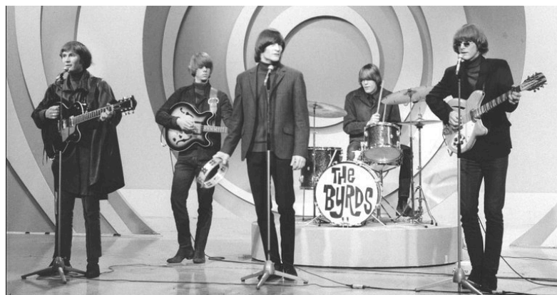
The Byrds: David Crosby (guitar, vocals) 1964-1967, Chris Hillman (bass, vocals) 1964-1968, Gene Clark (vocals, tambourine, guitar) 1964-1966, Michael Clarke (drums) 1964-1967, and Roger McGuinn (guitar, vocals) 1964-1973.