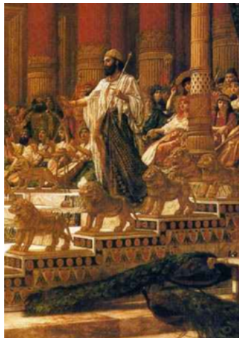
Detail from a color sketch by Edward Poynter for his 1890 painting “The Visit of the Queen of Sheba to King Solomon”

Pete Seeger’s lyrics were taken from a portion of Ecclesiastes 3:1-8 . They were rearranged and paired