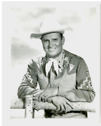
Gene Autry, the singing cowboy in the 1950s