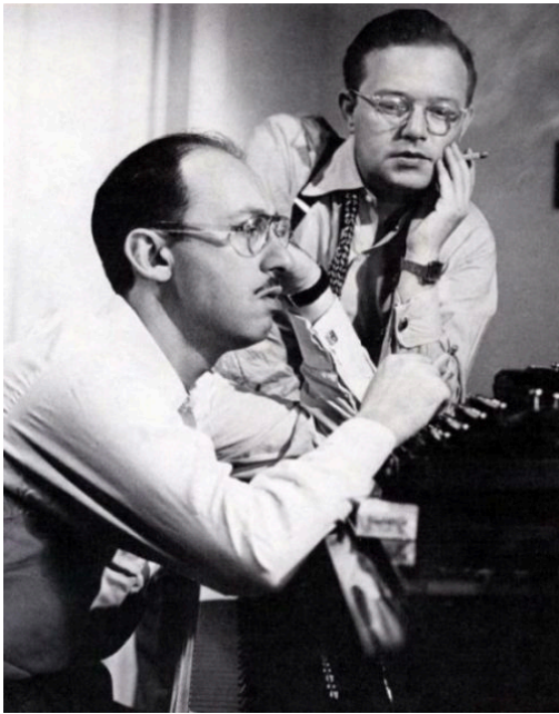
Sammy Cahn and Julie Styne