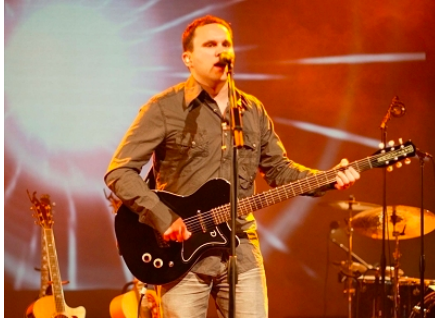
Matt Redman

Matt Redman is a prolific song writer with many Christian artists performing his works. He says the story behind “The Heart of Worship” in particular is a personal reminder that, “I’m just a little songwriter—and a pretty foolish one at that!”