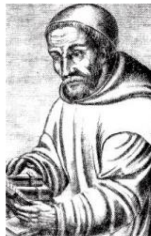
Rabanus Maurus

O Come, Creator Spirit, come; Christ, the fair glory of the holy angels. Come, Holy Ghost, our souls inspire; Come, Holy Ghost, Creator blest.