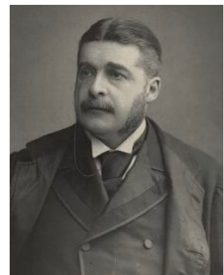
Arthur Sullivan in 1888