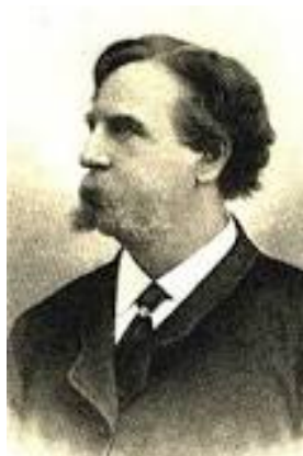
Richard Storrs Willis