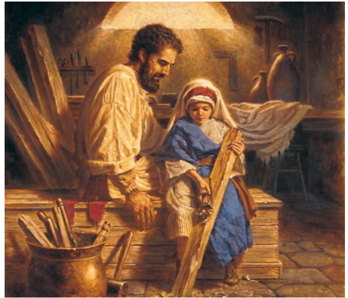
Solemnity of Saint Joseph

He had no relations with her until she bore a son, and he named him Jesus.