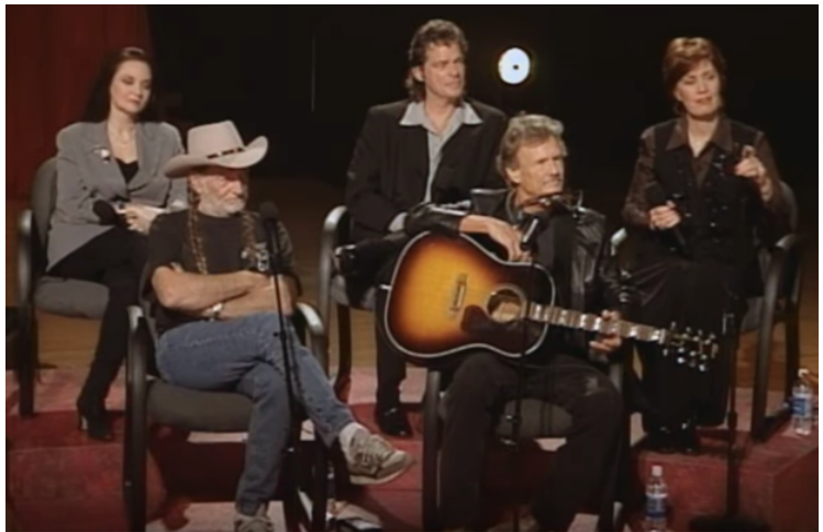
Kris telling the story of how “Why Me Lord” came to be written.

See Kristofferson telling the story of how this song came to be at http://keanradio.com/kris-kristofferson-tells-the-story-about-writing-the-song-why-me-lord-while-being-saved/