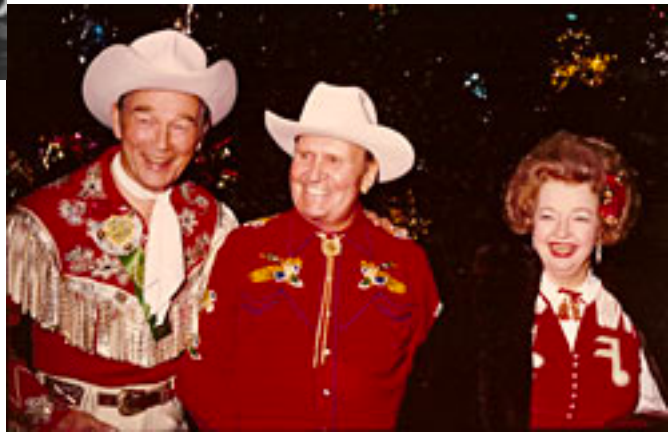
Roy Rogers, Grand Marshall Gene Autry, Dale Evans at the Hollywood Christmas Parade 1980.

Gene Autry said he conceived the song, " Here Comes Santa Claus " riding ahead of the Santa float on his horse down Sunset and Hollywood Boulevards, in the annual Hollywood Christmas parade of 1947. The children were yelling, "Here comes Santa Claus! Here Comes Santa Claus!!"