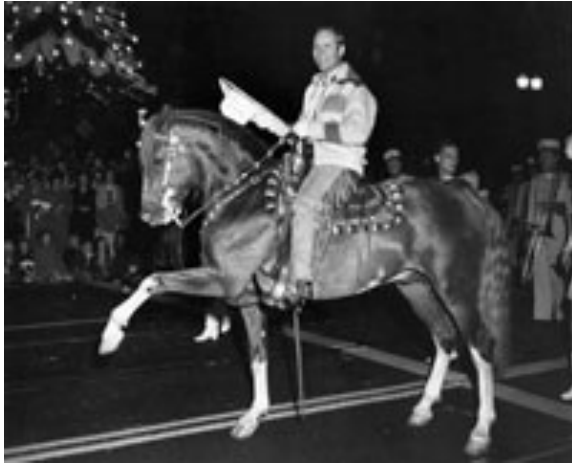
Gene Autry at the Hollywood Christmas Parade 1947, the ride that inspired this song.

Gene Autry also was the man who popularized "Rudolph the Red-Nosed Reindeer" and "Frosty the Snowman." Other songwriters wrote those for him.